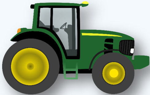
Agri- Equipment Rental Market