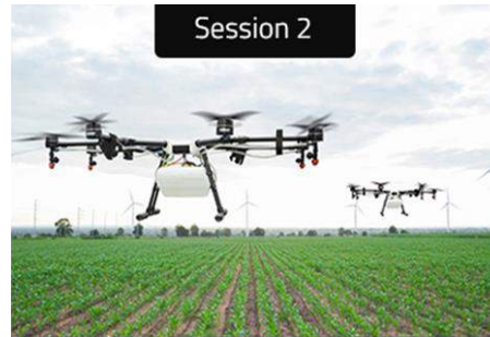
Session 2 Next-Gen Heroes in AgTech