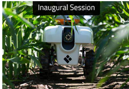
Inaugural Session Strategizing Indian Agtech@75