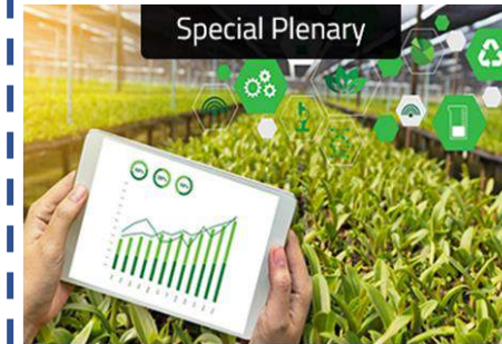
Special Plenary Scaling Deployment of Digital Agriculture - Policy & Partnerships