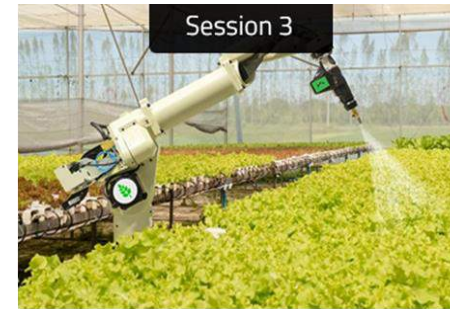
Session 3 Innovative Approaches to Traditional Agricultural Challenges